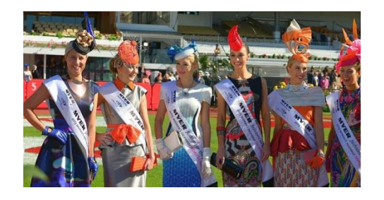
Cost $30.00 per person

Come along and join in the sweeps and our "Fashion on the Field" parade with prizes for best dressed lady and couple.